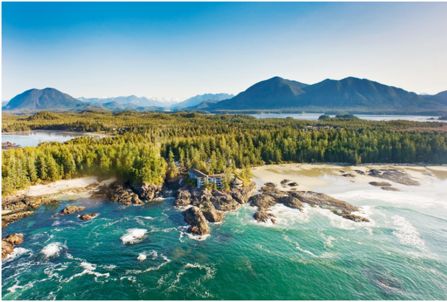
Wickaninnish Inn, Tofino

If you like the idea of getting hitched on Canadian soil but still want to get away from it all, might we suggest a beach on the farthest edge of British Columbia? This rustic-meets-luxe lodging offers an elopement package that promises to take care of every detail: photographers, an officiant and even witnesses.