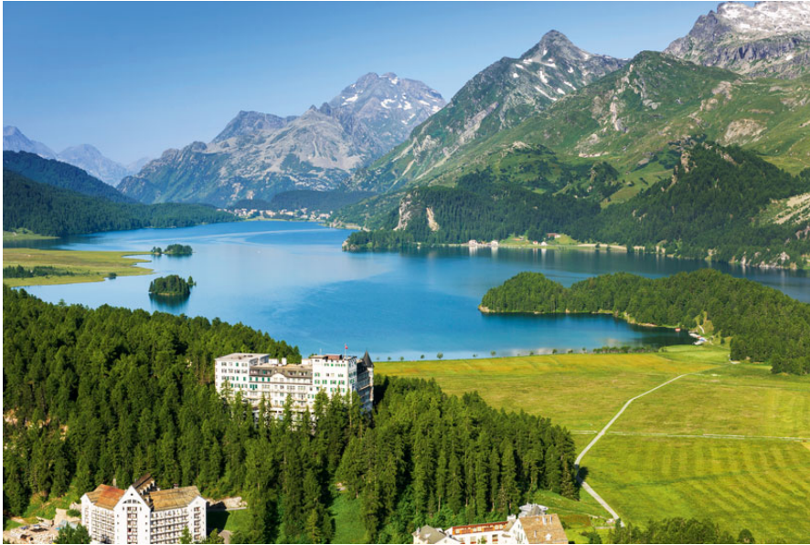
Waldhaus Sils, Switzerland

Fancy a quasi-royal wedding (but without hundreds of thousands watching)? Tucked in the Swiss Alps, this historic property has all the charm of a fairy-tale castle with the sorts of amenities a queen like you deserves, such as the new spa developed by natural-beauty guru Susanne Kaufmann.