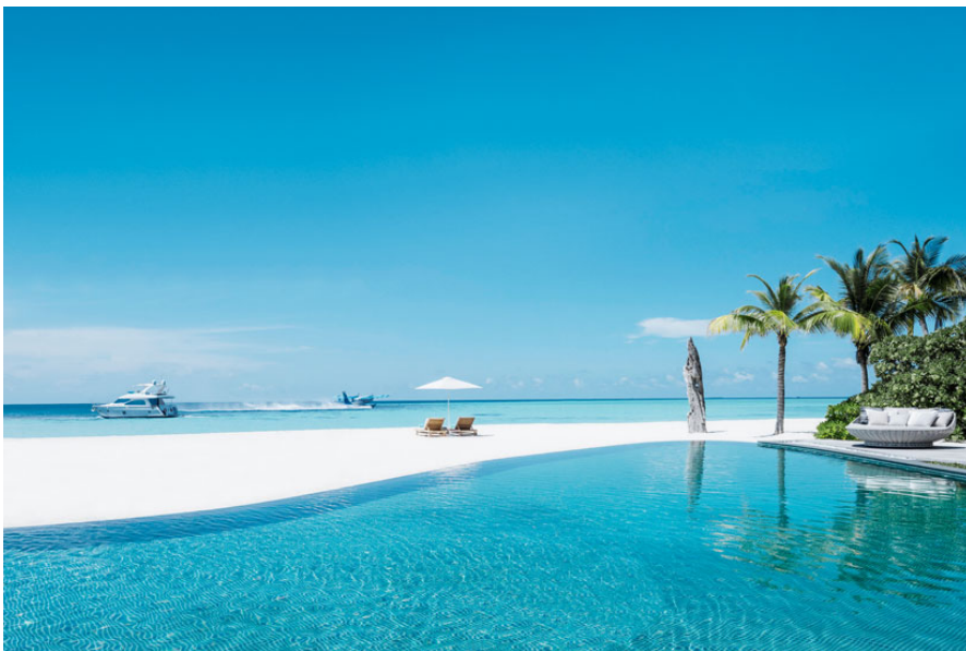
Voavah Private Island, The Maldives